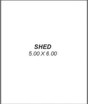
SHED 5.00 X 6.00