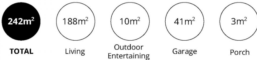
Floorplan for Townhouses 1 & 2

Scale in metres. This drawing is for illustration purposes only. All measurements are approximate and details intended to be relied upon should be independently verified.