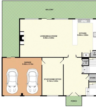
SELF-CONTAINED APARTMENT APPROX. FLOOR AREA: 180.0 SQ.M. (1938 SQ.FT.)