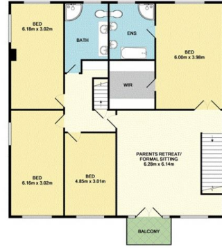
UPPER LEVEL APPROX. FLOOR AREA: 110.0 SQ.M. (1182 SQ.FT.) TOTAL APPROX. FLOOR AREA: 415.2 SQ.M. (4467 SQ.FT.) Notes: Areas shown are approximate and do not include the area of the front porch, rear porch, and driveway. All areas are shown as approximate and do not include the area of the front porch, rear porch, and driveway. The carport, driveway and garage shown have not been measured and no guarantee is given for the approximate area shown.