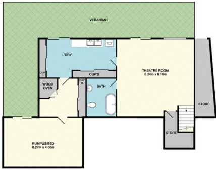
LOWER LEVEL APPROX. FLOOR AREA: 117.2 SQ.M. (1251 SQ.FT.)